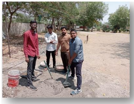
Mixing of Concrete:

The cell mould assembled punctually with none correction. And a skinny subcaste of canvas also shall be applied on all the faces of the mould. it is important that cell side faces should be resemblant. The concrete sample stuffed into the cell mould in three layers, every subcaste Roughly 5 cm deep. In containerful every scoopful of concrete, and it removed with care while not disturbing the concrete block slides. every subcaste shall be compacted by temping rod or by the vibration. The strokes shall be piercing into the underpinning Subcaste and the nethermost subcaste shall be rodded throughout its depth. wherever voids are left by the tamping rod also the coming procedure is to joggle with vibrator table.