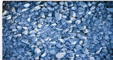
Fig. 2 Aggregate Sample

Consistence (factual, average, and bulk) Aggregate strength is defined as the maximum strength of the shoveled gemstone when squeezed. In a cylinder(crushed). For this reason, this index is mimicked. The resistance of gemstone material, for representative, is told by transport vehicles travelling over a road Face or by in the construction of roads, there's a mechanical impact (road breakers lay down and compact the asphalt). Depending summations are linked grounded on mass losses during testing as 200,400,600, 800,1000,1200 or 1400 are some specimens. The lesser the mark, the farther important the summations are. Depending on the type of gemstone and the grade at which it was set up, the content of bad gemstone grains after crushing.