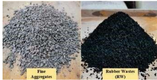
Fig. 1 Material Used for Study