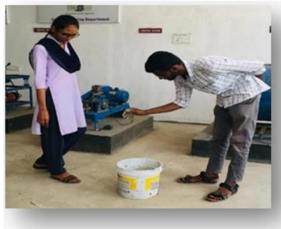
Field test of cement Observation:

5.2 Test for cement: Following tests were conducted on cement.